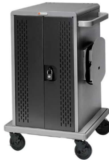
CORE® M Cart shown in Platinum (PM) with Black Pumice (BP) Doors

Keep Chromebooks, laptops and tablets charged and ready to go. The Core® M Charging Cart features a sleek customizable two-tone design, smart charging across devices, a secure locking system and world-class reliability.