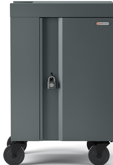
Element Cart shown in Cool Gray (CG)

Keep Chromebooks, laptops and tablets charged and ready to go. The Element Charging Cart features a sleek design, smart charging across devices, a secure locking system and world-class reliability.