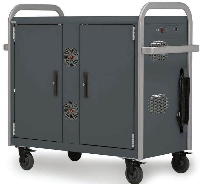
Manage Cart shown in Cool Gray (CG) with Platinum (PM) Rails

Keep laptops secure, charged and up to date. The rugged Manage Cart is equipped with Ethernet cables, dedicated space for a rack-mount network switch, and two fans for cooling. Making it easy for IT administrators to push updates to all devices simultaneously.