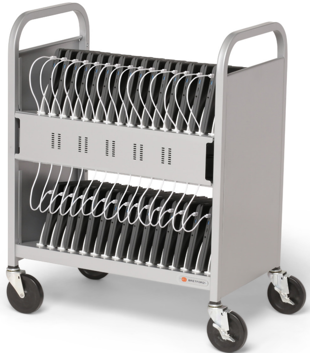
CUBE Transport ® Cart Pro shown in Platinum (PM)

The CUBE Transport ® Cart Pro with Opti-Sense is a lightweight, open-air USB-C PD charging cart designed for easy grab-and-go use. With adapter-free Opti-Sense smart charging and USB-C cables with LED indicators, your Chromebooks, laptops, and tablets stay charged, organized, and ready when you need them.