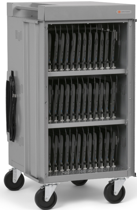
Element Slim shown in Platinum (PM)

The Element Slim is designed for today's high-demand environments. Its sleek design securely houses up to 30 devices, while delivering a consistent 45W of power to each. The result is efficient, reliable charging that keeps every device ready for action when needed.